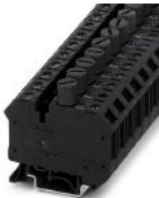
Fuse terminal block for cartridge fuse insert, cross section: 0.5 - 16 mm 2 , AWG: 24 - 6, width: 12 mm, color: black

Please be informed that the data shown in this PDF Document is generated from our Online Catalog. Please find the complete data in the user's documentation. Our General Terms of Use for Downloads are valid ( http://phoenixcontact.com/download )