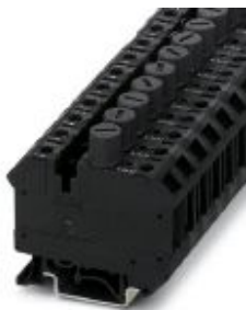
Fuse terminal block for cartridge fuse insert, cross section: 0.5 - 16 mm 2 , AWG: 24 - 6, width: 12 mm, color: black

Please be informed that the data shown in this PDF Document is generated from our Online Catalog. Please find the complete data in the user's documentation. Our General Terms of Use for Downloads are valid ( http://phoenixcontact.com/download )