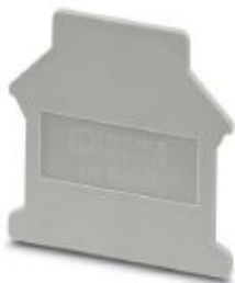
End cover, length: 42.5 mm, width: 1.5 mm, height: 54 mm, color: gray

Please be informed that the data shown in this PDF Document is generated from our Online Catalog. Please find the complete data in the user's documentation. Our General Terms of Use for Downloads are valid ( http://phoenixcontact.com/download )