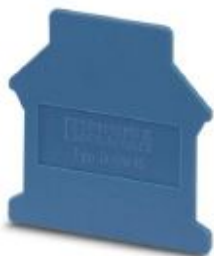
End cover, length: 42.5 mm, width: 1.5 mm, height: 54 mm, color: blue

Please be informed that the data shown in this PDF Document is generated from our Online Catalog. Please find the complete data in the user's documentation. Our General Terms of Use for Downloads are valid ( http://phoenixcontact.com/download )