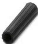
Insulating sleeve, color: black