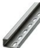
DIN rail perforated, G profile, width: 32 mm, height: 15 mm, acc. to EN 60715, material: Steel, galvanized, passivated with a thick layer, length: 2000 mm, color: silver

DIN rail perforated - NS 32 PERF 2000MM - 1201002