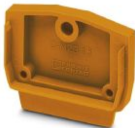
End cover, length: 32 mm, width: 4 mm, height: 22 mm, color: orange

Please be informed that the data shown in this PDF Document is generated from our Online Catalog. Please find the complete data in the user's documentation. Our General Terms of Use for Downloads are valid ( http://phoenixcontact.com/download )