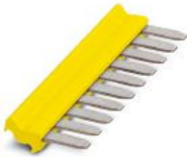
Plug-in bridge, pitch: 5.2 mm, number of positions: 10, color: green-yellow

Please be informed that the data shown in this PDF Document is generated from our Online Catalog. Please find the complete data in the user's documentation. Our General Terms of Use for Downloads are valid ( http://phoenixcontact.com/download )