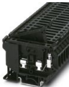
Fuse terminal block for cartridge fuse insert, cross section: 0.2 - 4 mm 2 , AWG: 26 - 10, width: 8.2 mm, color: Gray

Please be informed that the data shown in this PDF Document is generated from our Online Catalog. Please find the complete data in the user's documentation. Our General Terms of Use for Downloads are valid ( http://phoenixcontact.com/download )