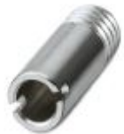
Female test connector, color: silver

Female test connector - PSB 6/5/6 - 0205290