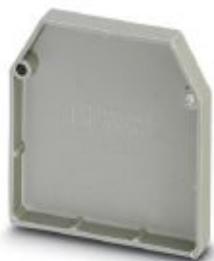
Separating plate, length: 50 mm, width: 7.5 mm, height: 52 mm, color: gray

Please be informed that the data shown in this PDF Document is generated from our Online Catalog. Please find the complete data in the user's documentation. Our General Terms of Use for Downloads are valid ( http://phoenixcontact.com/download )