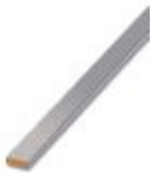
Neutral busbar, width: 10 mm, height: 3 mm, DIN VDE 0611-4: 1991-02, material: Copper, tin-plated, length: 1000 mm, color: silver

Neutral busbar - NLS-CU 3/10 SN 1000MM - 0402174