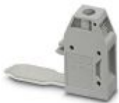
Pick-off terminal block, Can only be used in conjunction with UKH 95, nom. voltage: 1000 V, nominal current: 57 A, connection method: Screw connection, number of connections: 1, cross section: 0.5 mm 2 - 10 mm 2 , AWG: 20 - 8, width: 10.2 mm, height: 34.7 mm, color: gray, mounting type: on base element

Pick-off terminal block - AGK 10-UKH 95 - 3003541