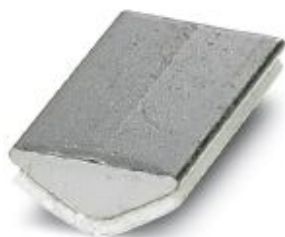
Insertion profile, color: silver

Please be informed that the data shown in this PDF Document is generated from our Online Catalog. Please find the complete data in the user's documentation. Our General Terms of Use for Downloads are valid ( http://phoenixcontact.com/download )