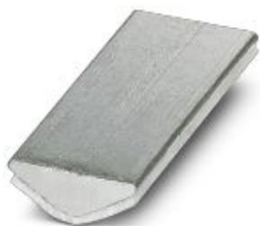
Insertion profile, color: silver

Please be informed that the data shown in this PDF Document is generated from our Online Catalog. Please find the complete data in the user's documentation. Our General Terms of Use for Downloads are valid ( http://phoenixcontact.com/download )