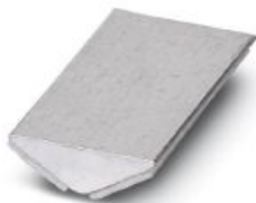
Insertion profile, color: silver

Please be informed that the data shown in this PDF Document is generated from our Online Catalog. Please find the complete data in the user's documentation. Our General Terms of Use for Downloads are valid ( http://phoenixcontact.com/download )