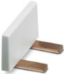
Insertion bridge, pitch: 17.8 mm, number of positions: 2, color: light gray

Please be informed that the data shown in this PDF Document is generated from our Online Catalog. Please find the complete data in the user's documentation. Our General Terms of Use for Downloads are valid ( http://phoenixcontact.com/download )