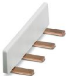
Insertion bridge, pitch: 17.8 mm, number of positions: 4, color: light gray

Please be informed that the data shown in this PDF Document is generated from our Online Catalog. Please find the complete data in the user's documentation. Our General Terms of Use for Downloads are valid ( http://phoenixcontact.com/download )