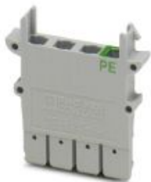
Connector housing, length: 31.6 mm, width: 5.2 mm, height: 31.7 mm, number of positions: 4, color: gray

Please be informed that the data shown in this PDF Document is generated from our Online Catalog. Please find the complete data in the user's documentation. Our General Terms of Use for Downloads are valid ( http://phoenixcontact.com/download )