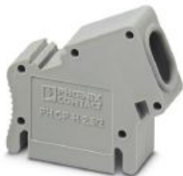
Cable housing, width: 10.4 mm, number of positions: 2, color: gray

Please be informed that the data shown in this PDF Document is generated from our Online Catalog. Please find the complete data in the user's documentation. Our General Terms of Use for Downloads are valid ( http://phoenixcontact.com/download )