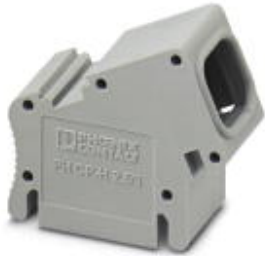
Cable housing, width: 15.6 mm, number of positions: 3, color: gray

Please be informed that the data shown in this PDF Document is generated from our Online Catalog. Please find the complete data in the user's documentation. Our General Terms of Use for Downloads are valid ( http://phoenixcontact.com/download )