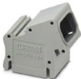
Cable housing, width: 20.8 mm, number of positions: 4, color: gray

Please be informed that the data shown in this PDF Document is generated from our Online Catalog. Please find the complete data in the user's documentation. Our General Terms of Use for Downloads are valid ( http://phoenixcontact.com/download )