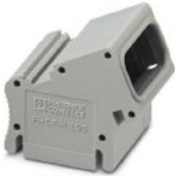
Cable housing, width: 26 mm, number of positions: 5, color: gray

Please be informed that the data shown in this PDF Document is generated from our Online Catalog. Please find the complete data in the user's documentation. Our General Terms of Use for Downloads are valid ( http://phoenixcontact.com/download )