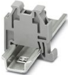
Snap-on end bracket, to be snapped onto NS 15 DIN rail

Please be informed that the data shown in this PDF Document is generated from our Online Catalog. Please find the complete data in the user's documentation. Our General Terms of Use for Downloads are valid ( http://phoenixcontact.com/download )