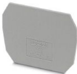
End cover, length: 40 mm, width: 1.1 mm, height: 28.9 mm, color: gray

Please be informed that the data shown in this PDF Document is generated from our Online Catalog. Please find the complete data in the user's documentation. Our General Terms of Use for Downloads are valid ( http://phoenixcontact.com/download )