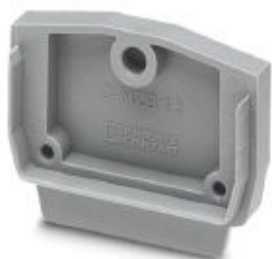
End cover, length: 32 mm, width: 4 mm, height: 22 mm, color: gray

Please be informed that the data shown in this PDF Document is generated from our Online Catalog. Please find the complete data in the user's documentation. Our General Terms of Use for Downloads are valid ( http://phoenixcontact.com/download )