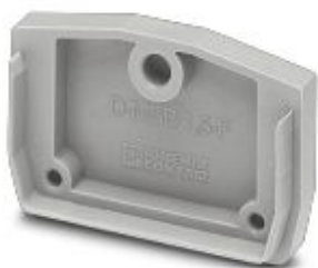
End cover, length: 32 mm, width: 9.9 mm, height: 22 mm, color: gray

Please be informed that the data shown in this PDF Document is generated from our Online Catalog. Please find the complete data in the user's documentation. Our General Terms of Use for Downloads are valid ( http://phoenixcontact.com/download )