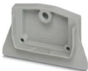
End cover, length: 41 mm, width: 4 mm, height: 24.3 mm, color: gray

Please be informed that the data shown in this PDF Document is generated from our Online Catalog. Please find the complete data in the user's documentation. Our General Terms of Use for Downloads are valid ( http://phoenixcontact.com/download )