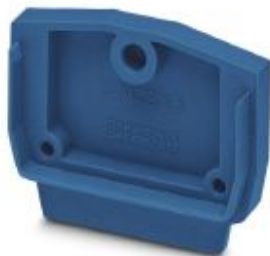
End cover, length: 32 mm, width: 4 mm, height: 22 mm, color: blue

Please be informed that the data shown in this PDF Document is generated from our Online Catalog. Please find the complete data in the user's documentation. Our General Terms of Use for Downloads are valid ( http://phoenixcontact.com/download )