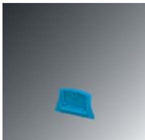
End cover, length: 41 mm, width: 4 mm, height: 24.3 mm, color: blue

Please be informed that the data shown in this PDF Document is generated from our Online Catalog. Please find the complete data in the user's documentation. Our General Terms of Use for Downloads are valid ( http://phoenixcontact.com/download )