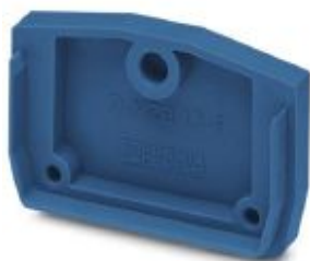
End cover, length: 32 mm, width: 9.9 mm, height: 22 mm, color: blue

Please be informed that the data shown in this PDF Document is generated from our Online Catalog. Please find the complete data in the user's documentation. Our General Terms of Use for Downloads are valid ( http://phoenixcontact.com/download )