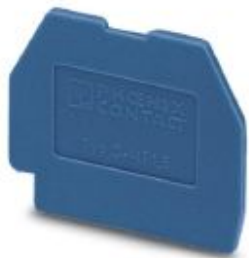
End cover, length: 22 mm, width: 1 mm, height: 17.7 mm, color: blue

Please be informed that the data shown in this PDF Document is generated from our Online Catalog. Please find the complete data in the user's documentation. Our General Terms of Use for Downloads are valid ( http://phoenixcontact.com/download )