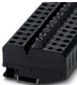
Spring-cage terminal block-fuse terminal block for cartridge fuse inserts with screw cap, cross section: 0.5 - 6 mm 2 , width: 12 mm, color: black

Please be informed that the data shown in this PDF Document is generated from our Online Catalog. Please find the complete data in the user's documentation. Our General Terms of Use for Downloads are valid ( http://phoenixcontact.com/download )