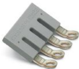
Insertion bridge, pitch: 9 mm, number of positions: 4, color: gray

Please be informed that the data shown in this PDF Document is generated from our Online Catalog. Please find the complete data in the user's documentation. Our General Terms of Use for Downloads are valid ( http://phoenixcontact.com/download )