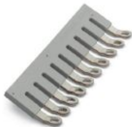
Insertion bridge, pitch: 9 mm, number of positions: 10, color: gray

Please be informed that the data shown in this PDF Document is generated from our Online Catalog. Please find the complete data in the user's documentation. Our General Terms of Use for Downloads are valid ( http://phoenixcontact.com/download )