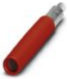
Female test connector, color: red

Female test connector - PSBJ-URTK 6 RD - 3026719