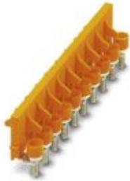
Switching jumper, pitch: 8.2 mm, width: 80.9 mm, number of positions: 10, color: orange

Please be informed that the data shown in this PDF Document is generated from our Online Catalog. Please find the complete data in the user's documentation. Our General Terms of Use for Downloads are valid ( http://phoenixcontact.com/download )