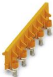
Switching jumper, pitch: 8.2 mm, number of positions: 10, color: orange

Please be informed that the data shown in this PDF Document is generated from our Online Catalog. Please find the complete data in the user's documentation. Our General Terms of Use for Downloads are valid ( http://phoenixcontact.com/download )