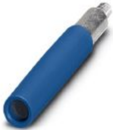
Female test connector, color: blue

Please be informed that the data shown in this PDF Document is generated from our Online Catalog. Please find the complete data in the user's documentation. Our General Terms of Use for Downloads are valid ( http://phoenixcontact.com/download )