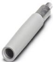
Female test connector, color: transparent

Please be informed that the data shown in this PDF Document is generated from our Online Catalog. Please find the complete data in the user's documentation. Our General Terms of Use for Downloads are valid ( http://phoenixcontact.com/download )