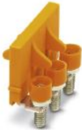
Switching jumper, pitch: 8.2 mm, width: 23.5 mm, number of positions: 3, color: orange

Please be informed that the data shown in this PDF Document is generated from our Online Catalog. Please find the complete data in the user's documentation. Our General Terms of Use for Downloads are valid ( http://phoenixcontact.com/download )