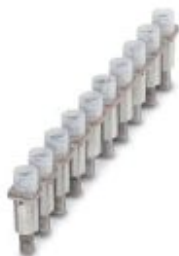
Fixed bridge, number of positions: 2, color: violet

Please be informed that the data shown in this PDF Document is generated from our Online Catalog. Please find the complete data in the user's documentation. Our General Terms of Use for Downloads are valid ( http://phoenixcontact.com/download )