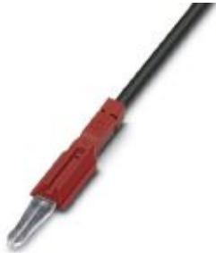
Test adapter, color: red

Please be informed that the data shown in this PDF Document is generated from our Online Catalog. Please find the complete data in the user's documentation. Our General Terms of Use for Downloads are valid ( http://phoenixcontact.com/download )