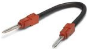
The figure shows the 60 mm version

Wire bridge, length: 250 mm, width: 5.1 mm, number of positions: 1, color: red/black