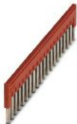
Plug-in bridge, pitch: 5.2 mm, number of positions: 20, color: red

Please be informed that the data shown in this PDF Document is generated from our Online Catalog. Please find the complete data in the user's documentation. Our General Terms of Use for Downloads are valid ( http://phoenixcontact.com/download )