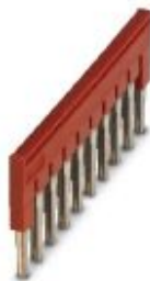
Plug-in bridge, pitch: 6.2 mm, width: 60.3 mm, number of positions: 10, color: red

Please be informed that the data shown in this PDF Document is generated from our Online Catalog. Please find the complete data in the user's documentation. Our General Terms of Use for Downloads are valid ( http://phoenixcontact.com/download )