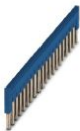
Plug-in bridge, pitch: 4.2 mm, number of positions: 20, color: blue

Please be informed that the data shown in this PDF Document is generated from our Online Catalog. Please find the complete data in the user's documentation. Our General Terms of Use for Downloads are valid ( http://phoenixcontact.com/download )