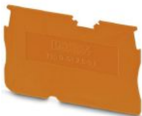
End cover, length: 48.6 mm, width: 0.8 mm, height: 29 mm, color: orange

Please be informed that the data shown in this PDF Document is generated from our Online Catalog. Please find the complete data in the user's documentation. Our General Terms of Use for Downloads are valid ( http://phoenixcontact.com/download )