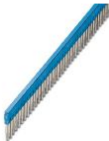
Plug-in bridge, pitch: 5.2 mm, number of positions: 50, color: blue

Please be informed that the data shown in this PDF Document is generated from our Online Catalog. Please find the complete data in the user's documentation. Our General Terms of Use for Downloads are valid ( http://phoenixcontact.com/download )