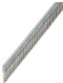
Plug-in bridge, pitch: 5.2 mm, number of positions: 50, color: gray

Please be informed that the data shown in this PDF Document is generated from our Online Catalog. Please find the complete data in the user's documentation. Our General Terms of Use for Downloads are valid ( http://phoenixcontact.com/download )