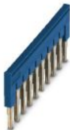
Plug-in bridge, pitch: 6.2 mm, width: 60.3 mm, number of positions: 10, color: blue

Please be informed that the data shown in this PDF Document is generated from our Online Catalog. Please find the complete data in the user's documentation. Our General Terms of Use for Downloads are valid ( http://phoenixcontact.com/download )