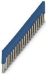
Plug-in bridge, pitch: 6.2 mm, width: 122.3 mm, number of positions: 20, color: blue

Please be informed that the data shown in this PDF Document is generated from our Online Catalog. Please find the complete data in the user's documentation. Our General Terms of Use for Downloads are valid ( http://phoenixcontact.com/download )